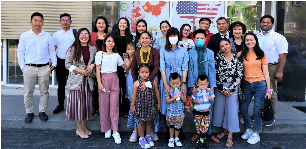
First Sunday of Our English Church, Standing in front of the Worship Centre after the service.

On week days, I go to Bible League office on Mondays and Wednesdays to teach English to Bible League staff.