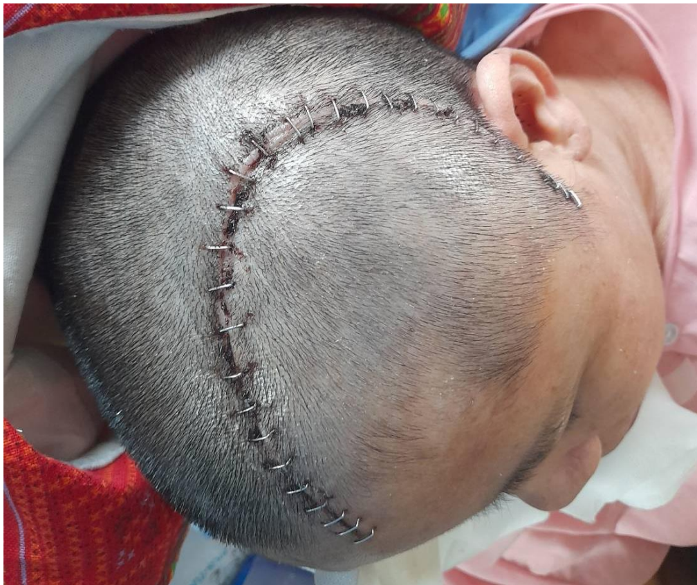
Caption of the wound after cranioplasty. All the three surgeries were done on the same spot.